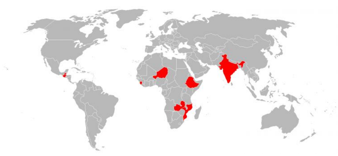
Figure 2: Current focus countries for UNFPA's Action for Adolescent Girls

UNFPA's Action for Adolescent Girls will be rolled out in 12 countries with high rates of child marriage and early childbearing. A set of 7 countries has already been identified for a first wave of investment. The remaining 5 countries will be selected based on need and interest, with some priority accorded to countries where UNFPA Country Offices are implementing the cluster mechanism (a cross-cutting team of UNFPA staff forming an Adolescents and Youth Cluster within the Country Office).