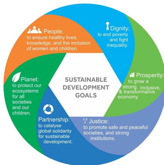
Figure 1. Six essential elements for delivering the SDGs

66. The following six essential elements would help frame and reinforce the universal, integrated and transformative nature of a sustainable development agenda and ensure that the ambition expressed by Member States in the outcome of the Open Working Group translates, communicates and is delivered at the country level (Figure 1).