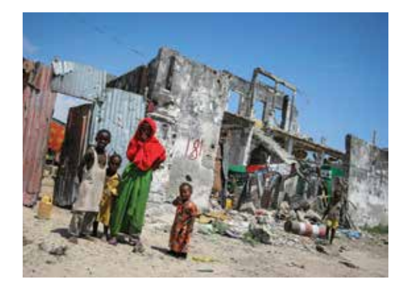
Children are pictured in front of their homestead in a derelict building in the Abdul-Aziz district of the Somali capital, Mogadishu.

There are enough resources to end extreme poverty in our time. It can be done.