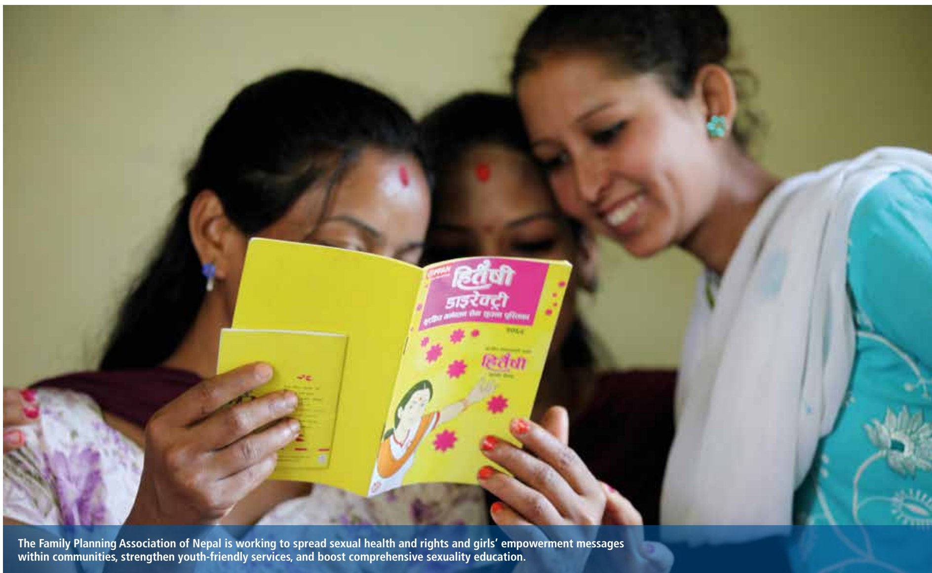
The Family Planning Association of Nepal is working to spread sexual health and rights and girls' empowerment messages within communities, strengthen youth-friendly services, and boost comprehensive sexuality education.