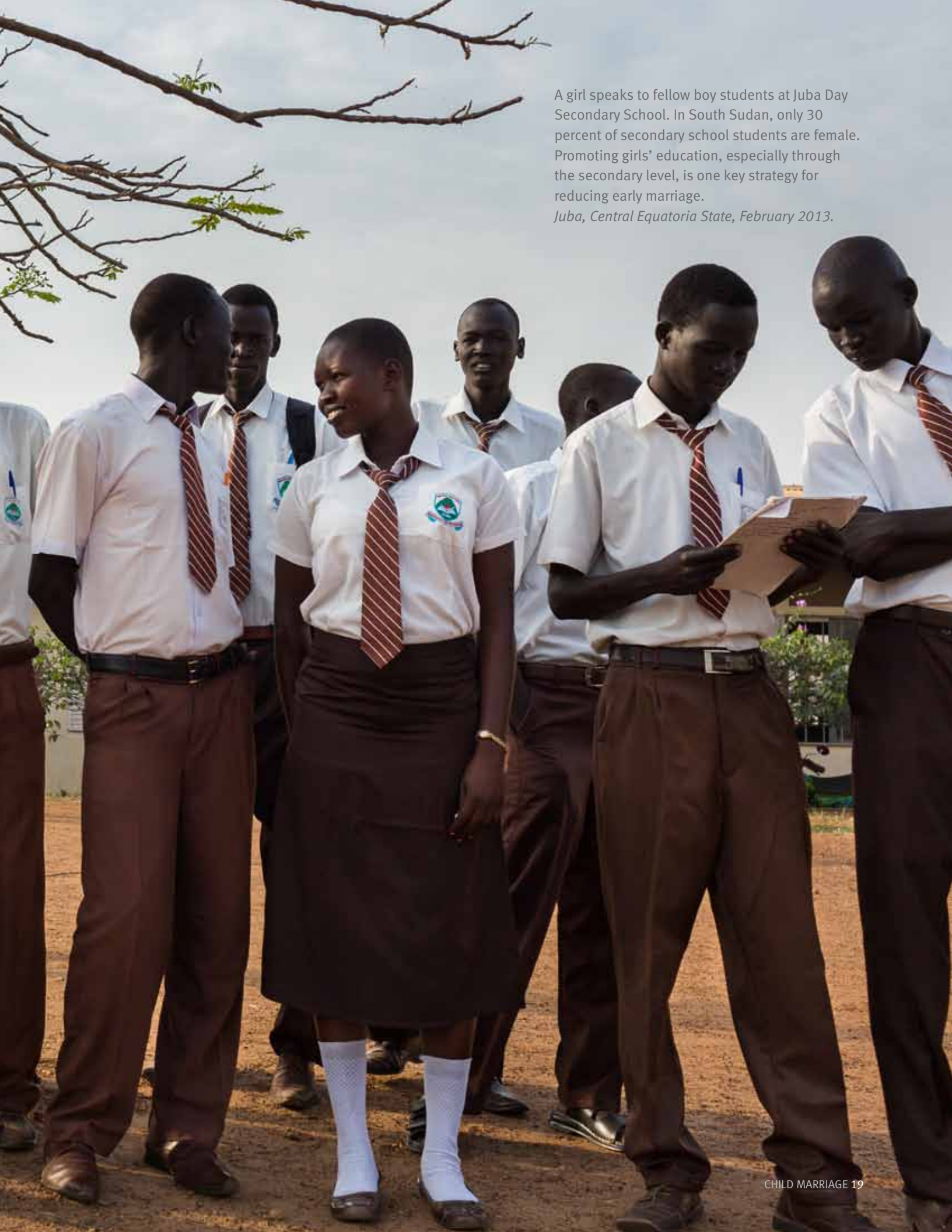
A girl speaks to fellow boy students at Juba Day Secondary School. In South Sudan, only 30 percent of secondary school students are female. Promoting girls' education, especially through the secondary level, is one key strategy for reducing early marriage. Juba, Central Equatoria State, February 2013.